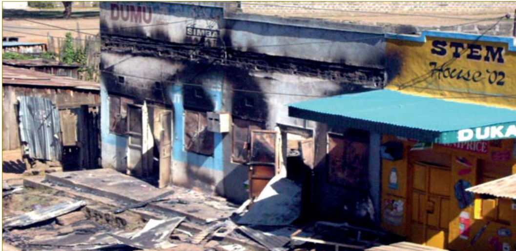
Shops vandalized and burnt down – Ndeffo, Njoro.

cards did not receive the 10,000 shillings that was distributed as compensation. 110