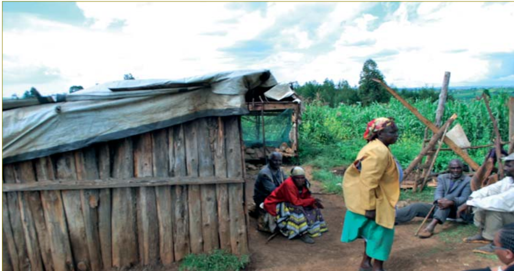
IDP returnees in Rukuini Burnt Forest.