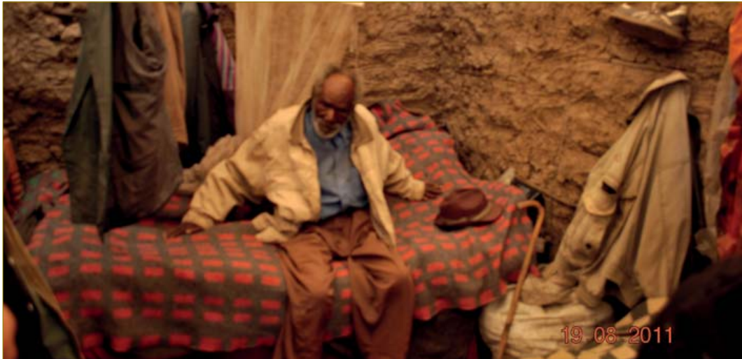
An elderly and sick Maua IDP in Nyandarua.