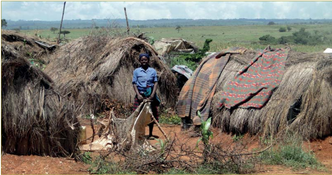
Kidipa IDP camp – Maili nne kwa Kung'u Nyahururu.

their farms, lack of farm inputs and the small size of their plots has rendered farming very challenging. For those who attempt to travel between the camp and their habitual residence in order to tend to farms, the situation is dire. For instance, in areas of Cherengany and Mt. Elgon, farmers who return to farm reported they are threatened or attacked by the local communities: