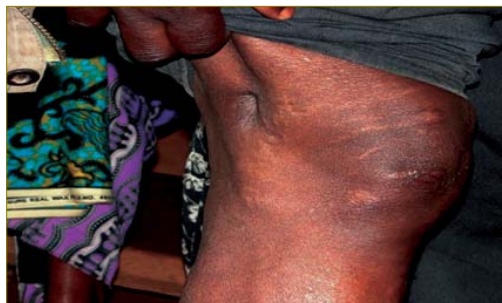
Arrow wound in one of the victims at Kwa Kung'u IDP camp Nyahururu.

Apart from compensation, victims also have a right to investigation of the deaths and justice for the crimes that led to the death of their loved ones. Although ICJ Kenya and KHRC researchers did not specifically examine the status of investigations and justice mechanisms for perpetrators of killings, others have done so. The CIPEV report indicated for many of the deceased victims that the medical examiner did record cause of death, information about the victims of killings as well as recording information about their family. 72 However, this does not amount to sufficient investigation, either for purposes of the right to justice or the right to know. A report by Human Rights Watch makes clear that State investigations of deaths during the post-election violence were entirely insufficient. Police refused to take reports from victims, failed to gather evidence and witness statements, were biased, and mishandled evidence. 73 As a result, the majority of legal cases related to killings during the post-election violence have been thrown out of court. Because of this failure to document and maintain evidentiary records, victims' rights to justice and to know the fate of their loved ones may never be vindicated.