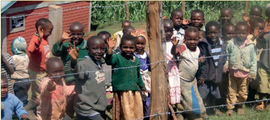
Mitoni IDPs in Molo Resettled area.

to Kenyans who were displaced, the Government now has the responsibility to provide compensation to victims for an entirely new class of human rights violations, those that took place while Kenyans were in camps or other residence as a result of displacement.