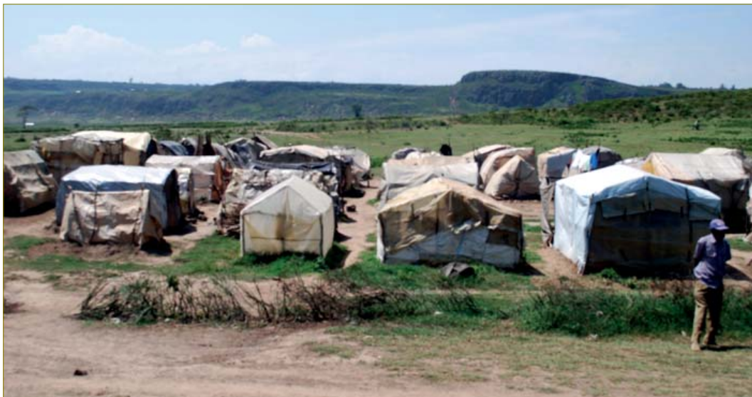
Kikopey Unrecognized IDP camp.

intended for the victims living at the camp. 89