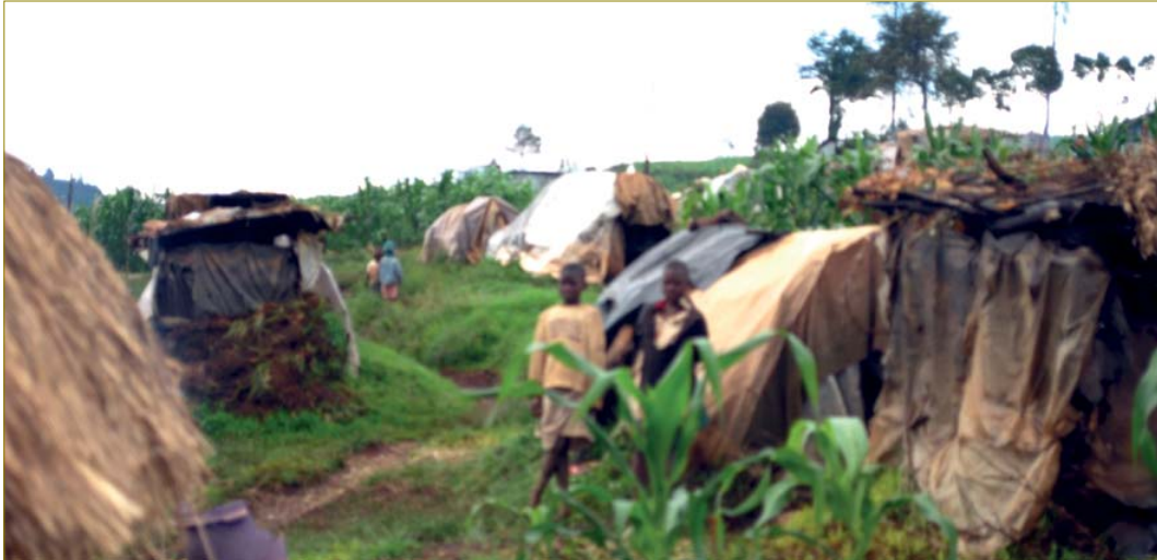
IDP returnees in Kuresoi.