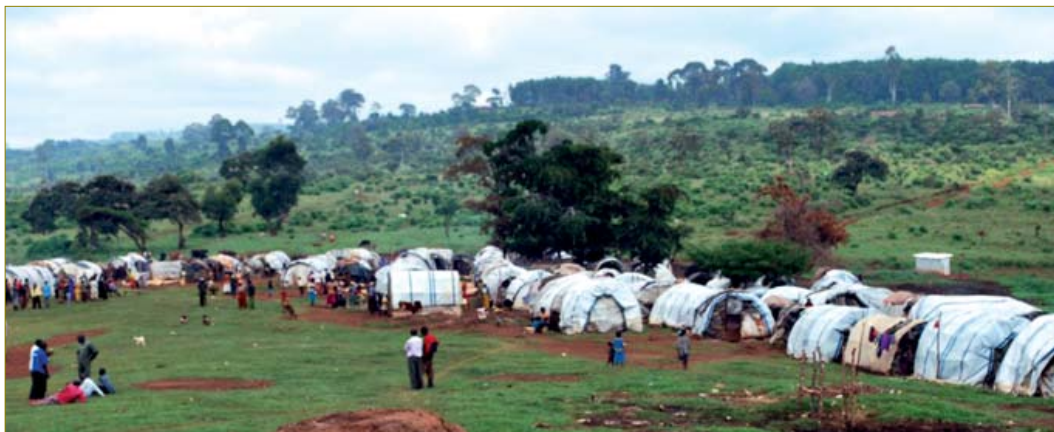
Embakasi IDP camp in Mt Elgon. Among those unprofiled by the government.