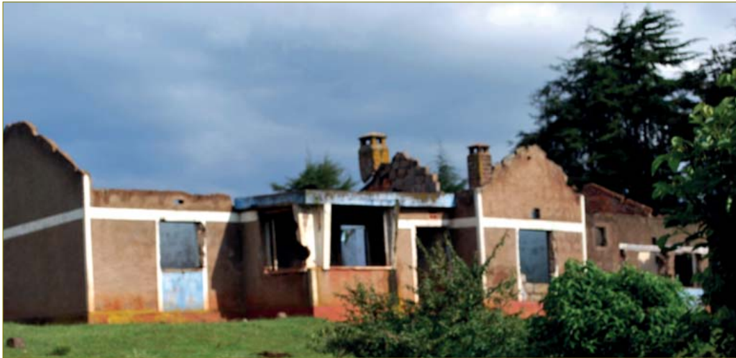
Shell of a house burnt in Burnt Forest.