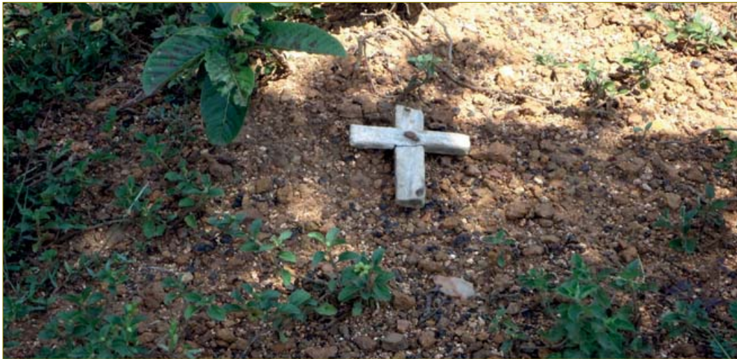
The grave, in Kisumu, of one of the victims who was transported from Rift Valley by his wife alongside other fleeing IDP.

families now. Given patterns of economic livelihood in Kenya, the fact that the deceased were mostly male indicates many families lost breadwinners. Indeed, it was clear from ICJ Kenya and KHRC's field work that this was the case. Among the victims of post-election violence are a substantial number of female-headed households with children who have been left close to destitute. Without long-term economic assistance to address the loss, these families will be severely impacted. For instance, one woman described the fate of her son, who had helped run her cell phone credit shop: